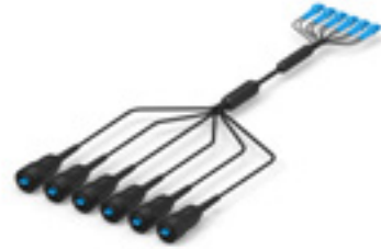
Fiber Optic Single Mode (FOSM) 2F FullAXS LC - LC Duplex